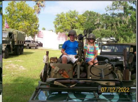
4TH OF JULY, SAFETY HARBOR, FL.