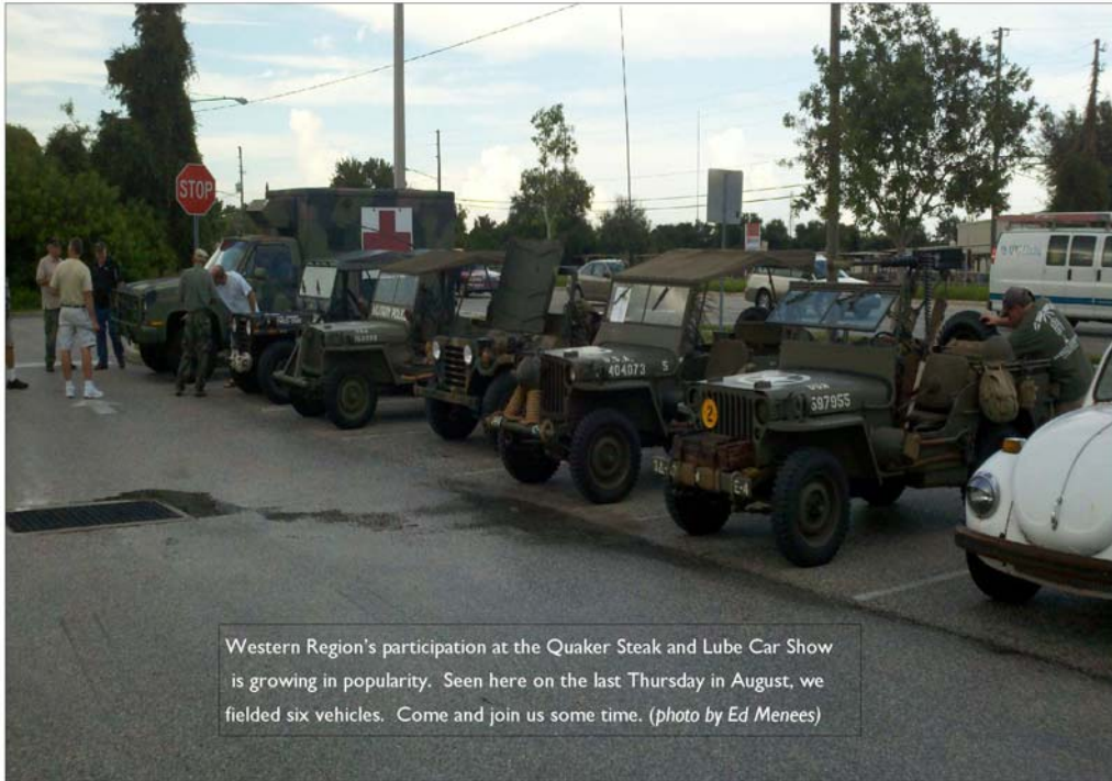
Western Region's participation at the Quaker Steak and Lube Car Show is growing in popularity. Seen here on the last Thursday in August, we fielded six vehicles. Come and join us some time.

Editor 6528 Summerfield Loop New Port Richey, FL. 34655